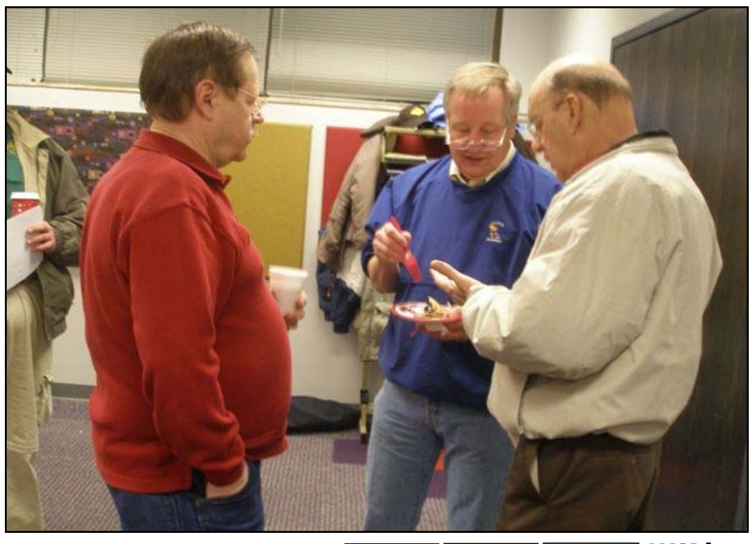
4 Page January 2008 Lightning Slinger