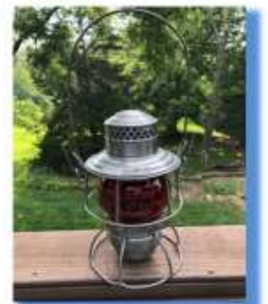
Best of Show Lantern Award