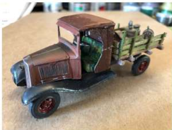
Larry’s most recent truck model. A modified O Scale Berkshire Valley kit.

Very helpful people and very nice museum includes a restored 1919 Traffic truck in the Lobby, a “cut-away” worm gear type rear differential, popular in trucks of 1910’s era, a large collection of model trucks (in glass cases), truck history books for sale, and a vast library of books on old trucks cataloged by manufacturer. All in all, a very cool place.