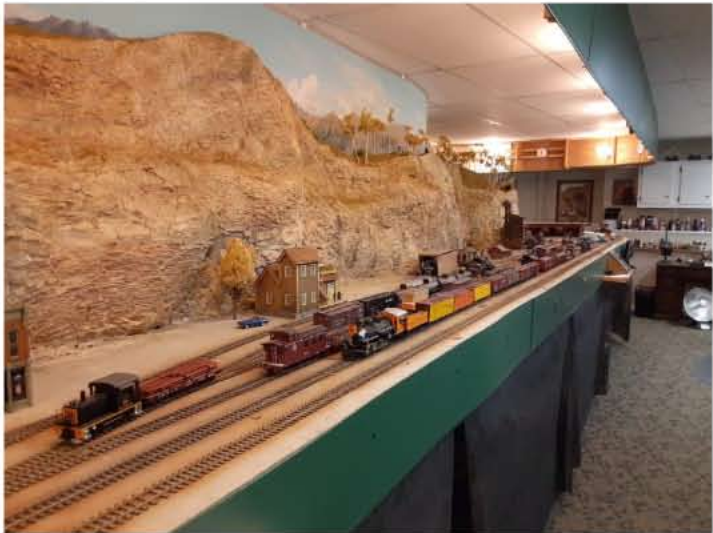
Looking into the Ridgway Yard toward the Roundhouse.