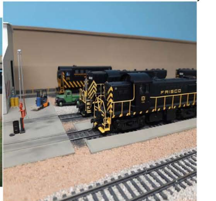
The Frisco 19th St yard services and repairs locomotive like those shown here.