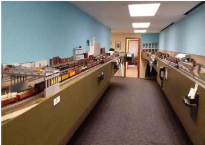
The main KC aisle with the Frisco Rosedale yard for outbound trains on the left and the Frisco 19th St yard on the right.