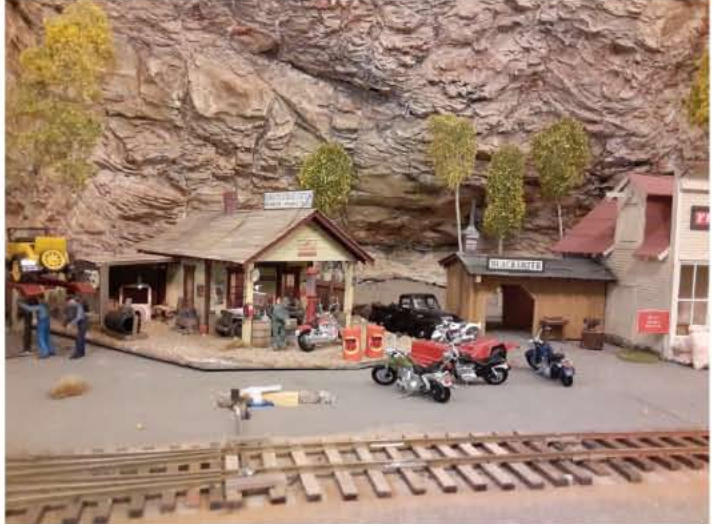
Raggs to Riches Gas station with lighting and sound.