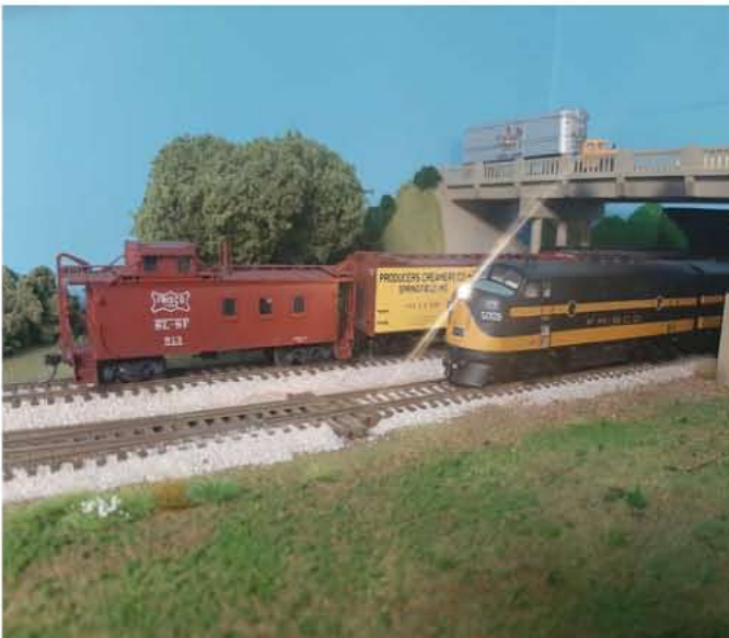
Frisco trains pass just west of the Frisco's Springfield yard.