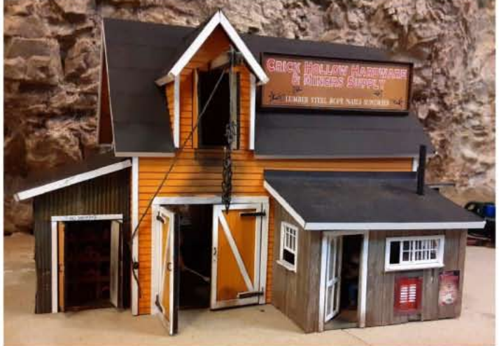
Banta Crick Hollow, door all hinged also has lighting inside and out.