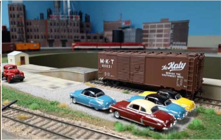
The 1950 Oldsmobiles are in! Here we see a car load at the M-K-T auto dock in the Glen Park yard.