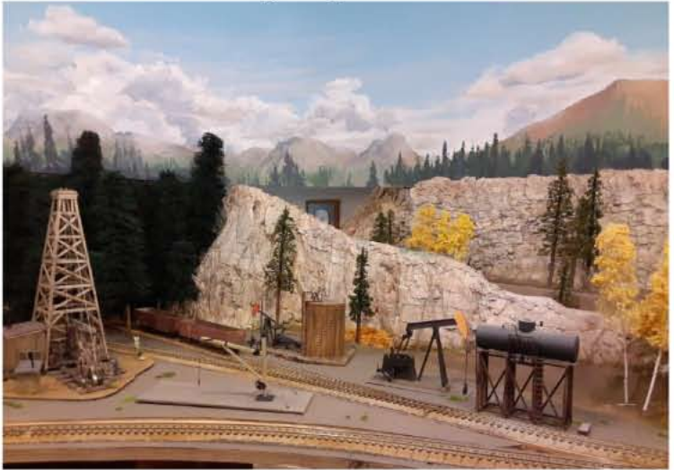
Stoney Creek oil rig and 2 smaller ones that run also equipped with lighting.