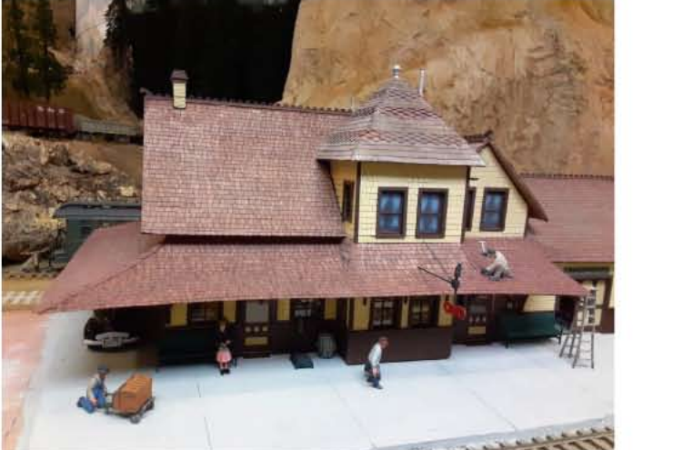
Banta Ridgway Depot, real glass windows and interior with lighting & sound.