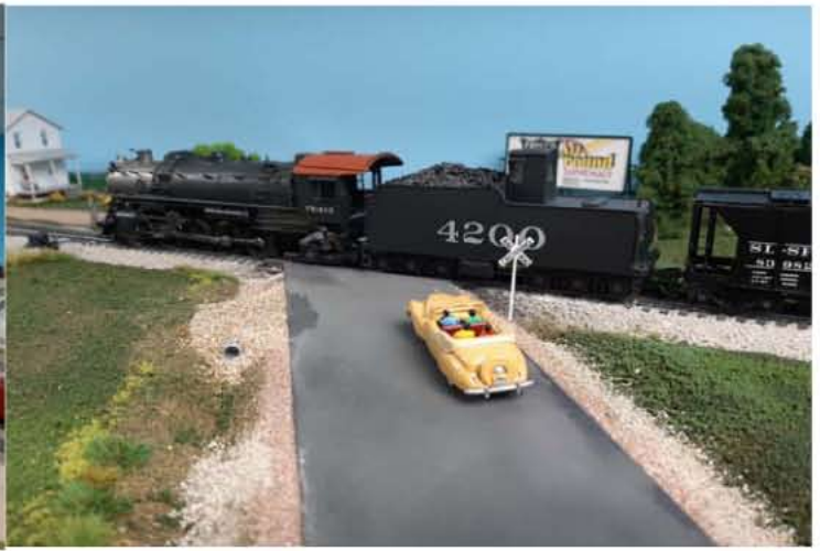
Frisco 4200 is at Spring Hill, KS and will tie up at the 19th St yard in KC.